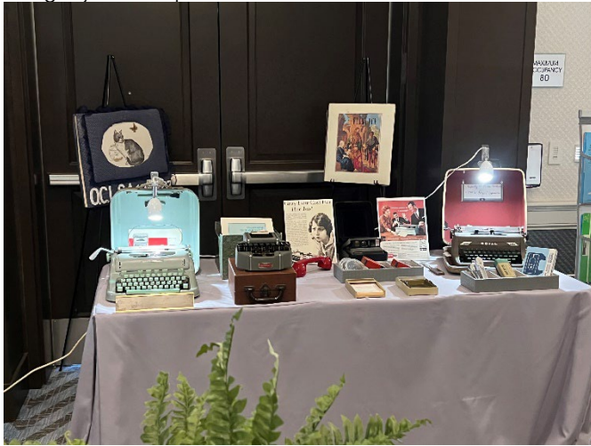
Legacy Room pictures