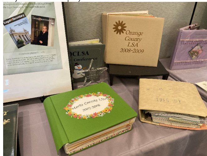
2007-2008 History Book on display