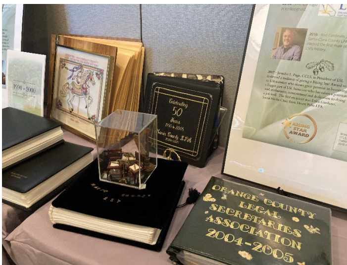
Our history books on display!