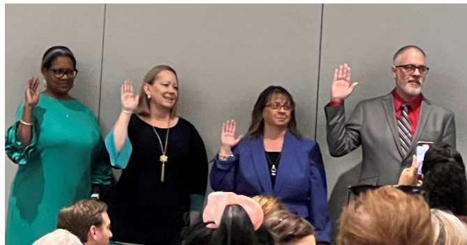
LPI Officers for 2022-2023 installation