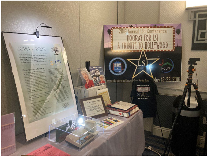
2016 Poster displayed in the Legacy Room